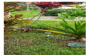
Beer Cans Thrown from Lanai