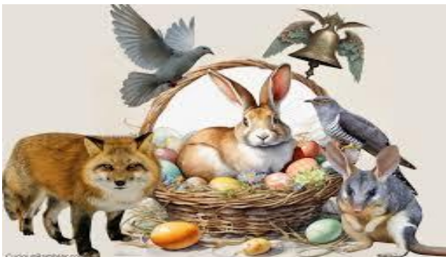
Easter Rabbit – Hare – Fox – Cuckoo & Bell

In Switzerland the Easter Bunny is replaced by an Easter Cuckoo. In Australia, eggs and chocolate are delivered by rabbit-like animal called a bilby.