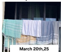
Clothing on Rails